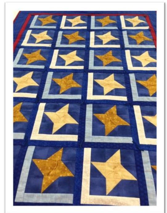
Presented to: Birt Etienne

It just goes to prove that Covid can not stop us. Even though we couldn't be together we were still able to do one of our most treasured projects.